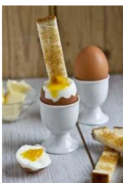
Eggs and soldiers

Sunday 16 th April will be Easter Sunday, a Christian event that celebrates the day on which Jesus was resurrected. On this day many people choose to eat eggs for breakfast as they symbolise new life. At home my family often enjoy our eggs in a traditional style known as "Eggs and Soldiers".