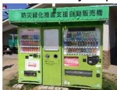
Emergency vending machine

During our short break at the Bouga River Park, one of the guides who was surprised after hearing that we do not have earthquakes in the U.K, showed me the facilities that were installed at the park in case of natural disasters. I thought that the drinks vending machine in particular, which automatically dispenses drinks for free following a disaster was a very clever idea!